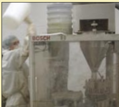
NLI operator places more capsules into automated filling machine that opens each, places product inside and then recaps and locks the capsule shut.

Rooted in the Quality body of knowledge, Six Sigma is a process designed to make decisions more systematically based on data. The term hails from the Motorola® drive for defect reduction in the 1980s. Lean Manufacturing targets elimination of non-value-added activities. Together, they are very powerful.